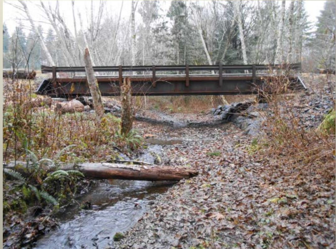
After – 46' long x 14' wide bridge.