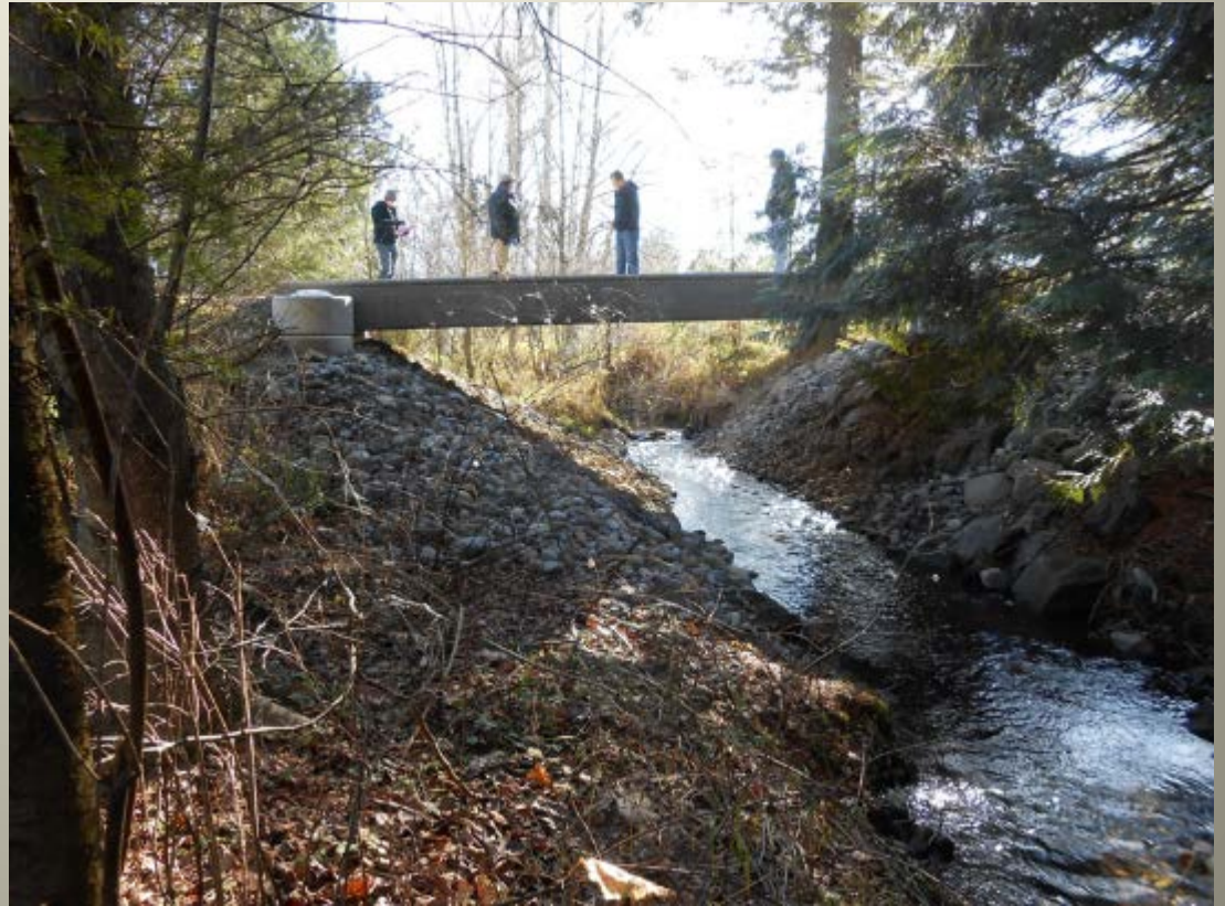
After -36' L X 14' W Bridge