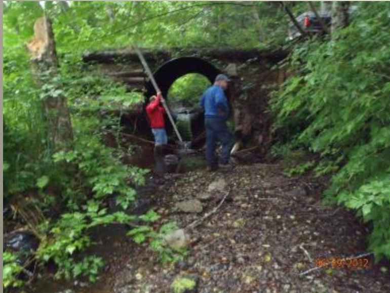
Outlet - Before