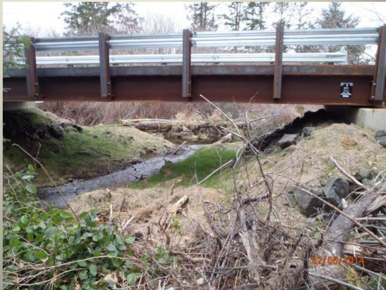
After from downstream