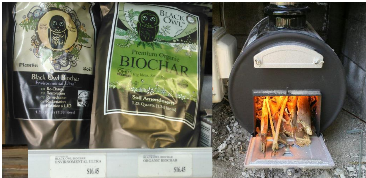
Biochar for sale (left) and a home boiler system (right).

Biochar and boiler heating systems offer two new potential methods to convert significant quantities of forest biomass into key resources to meet the County's food and energy needs. Both biochar and boiler systems limit the need for imported fertilizers and fossil fuels, potentially creating increasingly closed-loop local systems. Biochar and boiler technologies also offer a potentially synergistic model for the most economical use of woody biomass transport, with community boiler systems utilizing forest residues from surrounding urban centers and biochar production occurring in more remote locations. This diversified approach to creating market channels for forest products appears to be the most robust model for addressing the County's biomass and fire hazards.