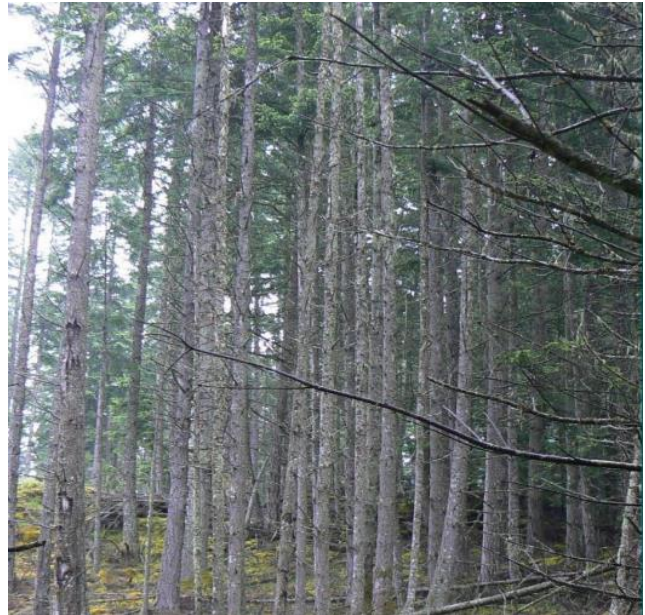
A dense San Juan stand.

The 2012 San Juan County Fire Assessment found 84,716 acres in San Juan County in need of fuel reduction. This acreage was defined as having either moderate or high fire risk (SJC Fire Assessment, 2012). According to the United States Forest Service, the average wooded acre in the Puget Sound region contains 26,533 board feet timber (USFS: Washington's Forest Resources, 2002–2006 Five-Year Forest Inventory and Analysis Report), which is consistent with anecdotal forest inventories conducted across the San Juan Islands. A report analyzing local fuel reduction treatment in San Juan County found that restoration practices remove an average of 40% of a forest's total biomass (Turtleback Mountain Forest and Carbon Inventory, 2010). The same report models forest growth over the next 25 years and estimates a 68% increase in total biomass by the year 2040 if no thinning is conducted.