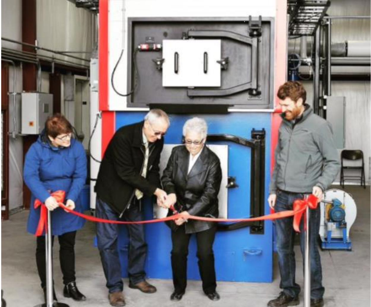
Celebrating the installation of a new wood boiler system providing power to a community.

The cost of natural gas heat can be double or triple the cost of heat from wood boilers. In San Juan County, where gas and fuel costs are higher because of ferry imports, utilizing local wood products for heat could potentially reduce energy costs for the community. Because the cost of biomass transport increases with distance from the boiler site, economic efficiency for boiler technologies would be maximized by using biomass surrounding urban centers for community heating systems. Further research should be conducted to understand costs of chipping, transport, and heating with wood boiler systems for each of the 3 major islands in San Juan County.