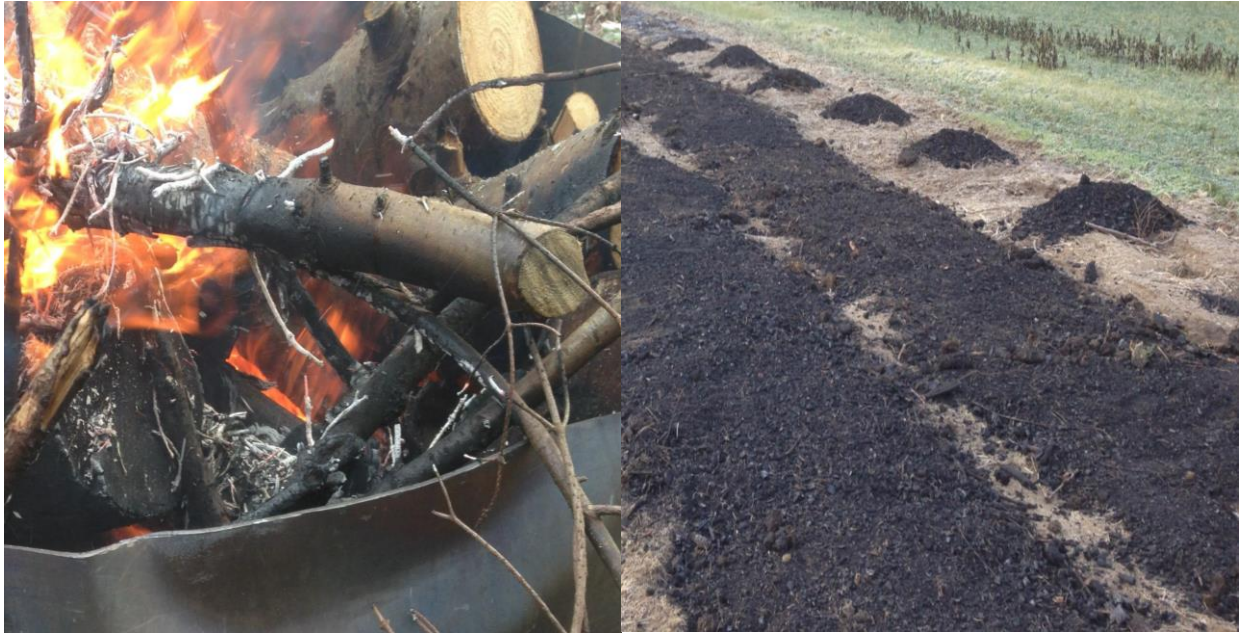
Biochar being manufactured (left) and used in agriculture as a soil amendment (right).

for sale. Restore Char aims to incubate 5 biochar businesses in San Juan County by 2018 to help generate a market for biochar produced locally from forest restoration material. The research team believes that the extended data gathered over 3 years in San Juan County will provide businesses and investors with the local evidence required to develop an expanding biochar market for gardens and small farms.