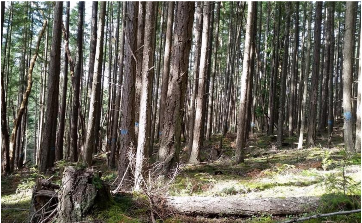
A typically dense forest in San Juan County.

San Juan County has more than 84,700 wooded acres in need of fuel reduction to increase forest health and decrease the expanding fire hazard in the region. These acres hold 899,785,579 board feet of excess biomass. Projections suggest that this excess biomass could grow to 1,512,129,015 board feet by 2040 if restoration practices are not conducted. Currently there are limited market channels for local wood products to economically incentivize fuel reduction—specifically for non-marketable timber and slash material. This assessment identifies the need for coordinated aggregation and distribution of wood products to retail markets to decrease barriers for retail purchase and sales. In addition, this assessment identifies two key emerging categories—biochar and boiler technologies—that illustrate significant potential to expand the market for small diameter woody biomass. A varied and coordinated approach to creating a network of market options for forest landowners presents an opportunity to address local forest health issues and decrease fire danger in the Washington archipelago.