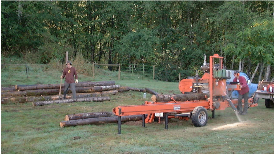
Fig 1. Aligning the mill and logs