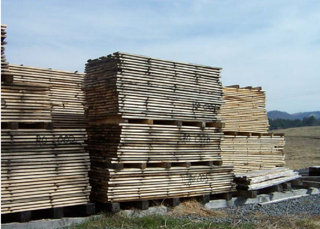
Fig 3. Stacking lumber

(Note: Outdoor stacks should have a cover and vapor barrier)